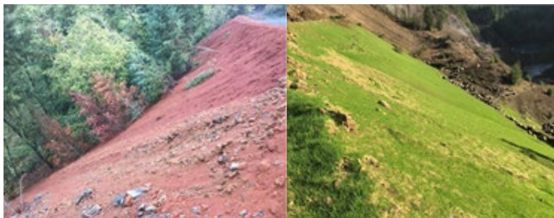
Slope before seeding