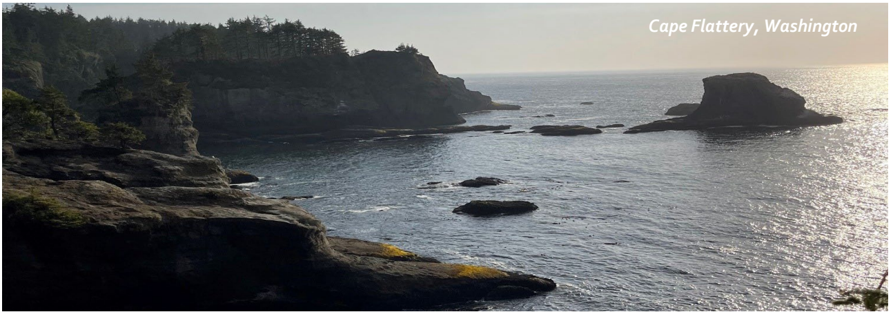
Cape Flattery, Washington