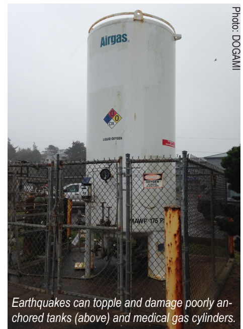
Earthquakes can topple and damage poorly anchored tanks (above) and medical gas cylinders.

When preparing your hospital to withstand shaking, give equal attention to nonstructural elements, such as fire-sprinkler and plumbing systems, ceilings, and decorative cladding, as well as medical equipment and contents. Unless properly designed, installed, and anchored, such elements can break or fall in an earthquake, injuring people, causing damage, blocking egresses, and putting the hospital out of action.