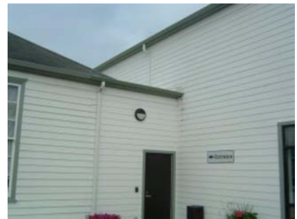
NE Vertical Irregularity Primary