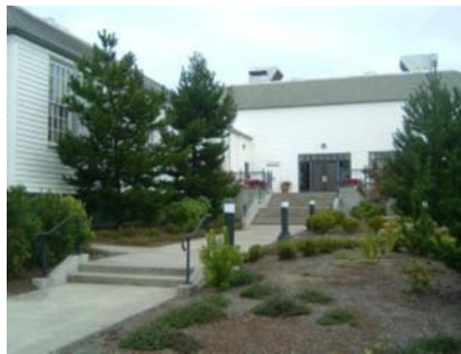
E Plan Irregularity Primary