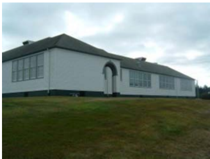
SW Plan Irregularity Primary